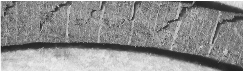
Lathe check on a beech veneer (thickness=3mm)